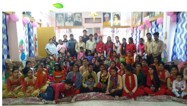
A glimpse of out reach programme at Orphanage

Faculty members of this institution render their help to different segments of the society. Being a socially sensitive citizen, our faculty members are involved in teaching Music, Dance, Paper craft to the weaker section of the society viz. children of Tea Garden workers, children of Brick Kiln workers, Orphanage, Old age homes etc. Faculty members also called on by Department of Social Welfare, Government of Tripura to impart training on music and dance for different target groups of the society.