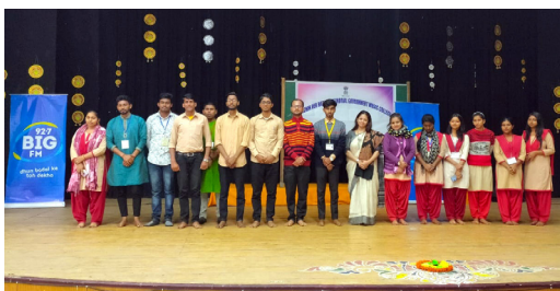
BIG FM Talent Hunt