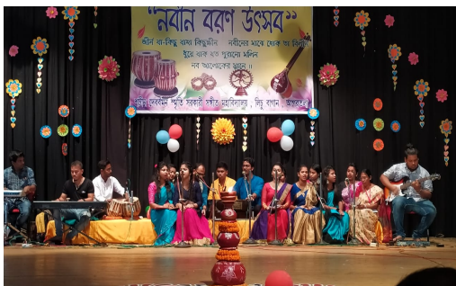
A glimpse of Freshers' welcome programme