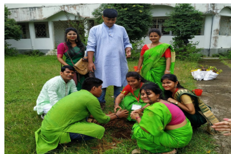
A glimpse of Plantation programme