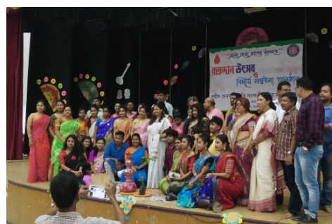
Fare well ceremony followed by Blood donation camp