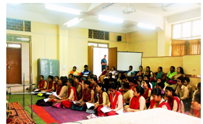
Induction programme of First semester students