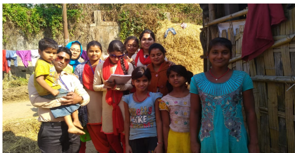
Awareness programme conducted by students

Faculty members of this institution render their help to different segments of the society. Being a socially sensitive citizen, our faculty members are involved in teaching Music, Dance, Paper craft to the weaker section of the society viz. children of Tea Garden workers, children of Brick Kiln workers, Orphanage, Old age homes etc. Faculty members also called on by Department of Social Welfare, Government of Tripura to impart training on music and dance for different target groups of the society.