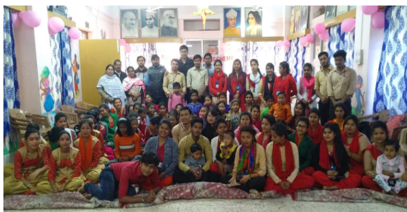
A glimpse of out reach programme at Orphanage

The prime task of the IQAC is to develop a system for conscious, consistent and catalytic improvement in the overall performance of institutions. The IQAC of the college since 2015, has organized manifold training programs required for office procedure for the office and supporting staff. Majority of them are computer savvy now. Information regarding monitoring and evaluating of different schemes are done with the help of this cell. The cell has developed faculty tool kit for some departments and for some teachers. The process is going on. The students are provided with the feedback form to evaluate the teachers. It helps to maintain continuous review of the teaching learning process. For maintaining the proper academic environment feedback from the parents or guardians in the form of parent/guardians - teachers meet is organized by IQAC.