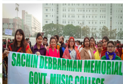
A glimpse of a Rally organized by the Institute