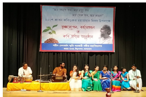
Kabi Pranam followed by Plantation programme