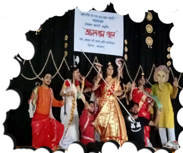
A glimpse of cultural programme