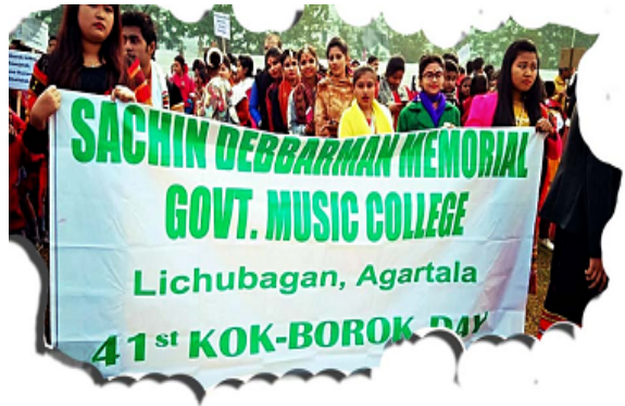
A glimpse of a Rally organized by the Institute

3) Admission to all courses shall be made strictly on the basis of merit of candidates. Practical examination and viva will be conducted to understand technical knowhow of the candidates. The mark of Practical examination will be counted for merit list preparation.