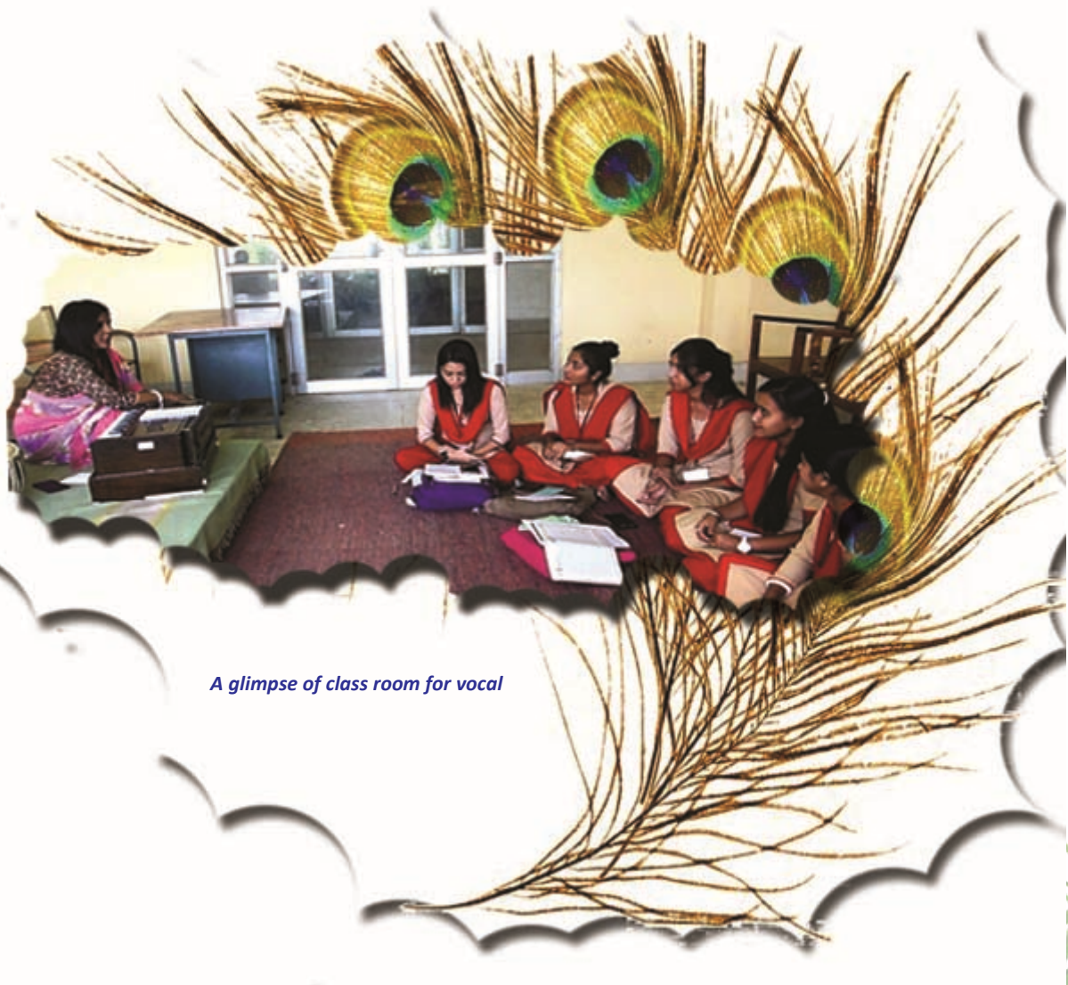
A glimpse of class room for vocal