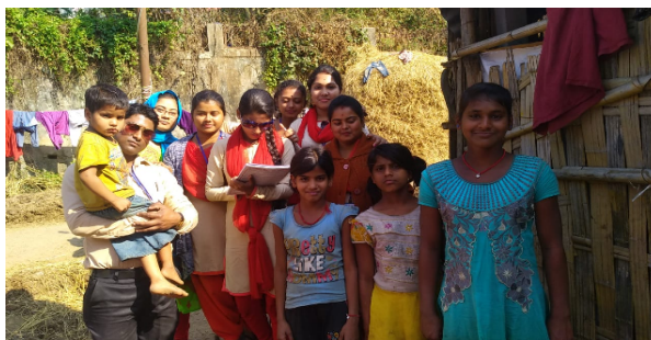
Awareness programme conducted by students

Faculty members of this institution render their help to different segments of the society. Being a socially sensitive citizen, our faculty members are involved in teaching Music, Dance, Paper craft to the weaker section of the society viz. children of Tea Garden workers, children of Brick Kiln workers, Orphanage, Old age homes etc. Faculty members also called on by Department of Social Welfare, Government of Tripura to impart training on music and dance for different target groups of the society.