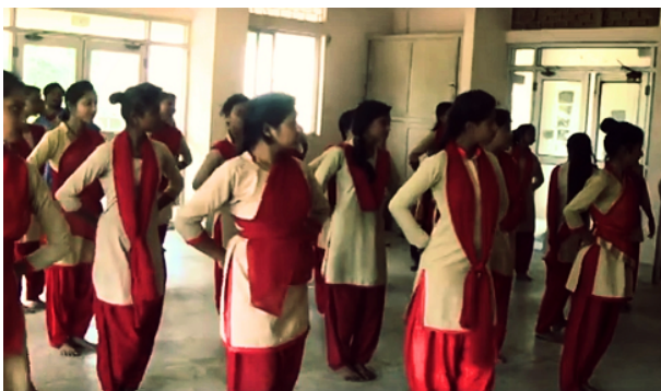
A glimpse of dance class