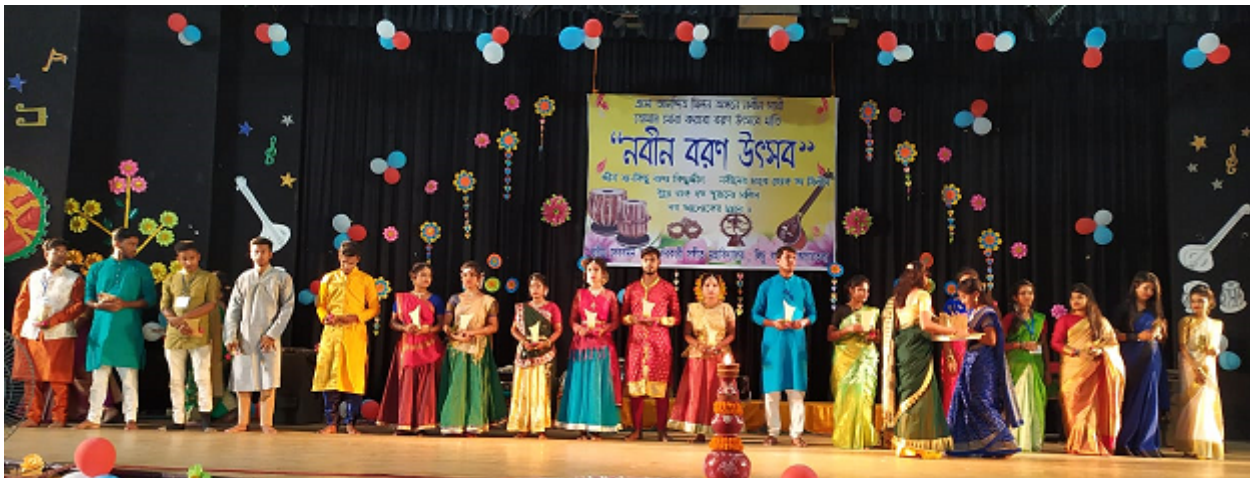
Freshers Welcome Ceremony in the Institute