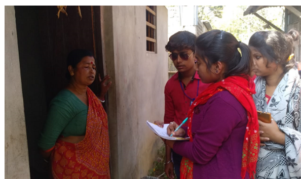
Awareness programme conducted by students

In addition to routine curricular activities and teaching-learning process, the college always gives emphasis on community development works. In order to achieve this along with inculcation of human values and social commitment among the students, the college encourages the students to take part in various programmes like Environment Awareness, Health Awareness, Legal Awareness, Blood donation camp, AIDS Control Programme, Disaster Management Programme, Women Empowerment Seminar, Literacy programme, Sanitation and cleanliness drive etc. As far as co-curricular extension services are concerned, the college has an NSS Units of 60 (sixty) volunteers which organize and conduct different social and community service activity in and outside the college on different occasion. A good proportion of students are actively inspired to take part in different social extension and community service activities organized by the NSS unit of the college. The aim of the college is not to produce graduates having theoretical knowledge only, but they are inculcated with moral and human values with a commitment in nation building.