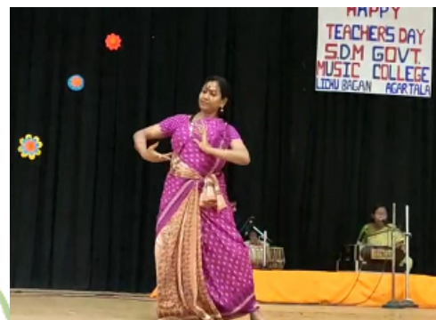
Performance of Teacher during Teachers' Day Celebration