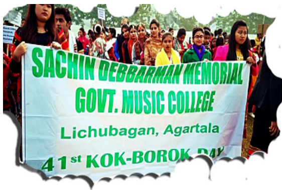
A glimpse of a Rally organized by the Institute