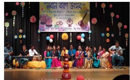
A glimpse of Freshers' welcome programme