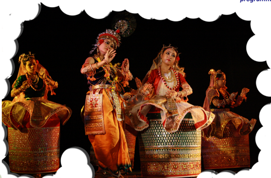
A glimpse of cultural programme