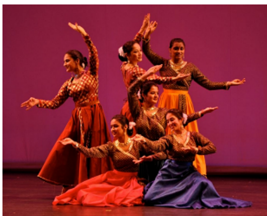
A glimpse of Cultural programme

3) Admission to all courses shall be made strictly on the basis of merit of candidates. Practical examination and viva will be conducted to understand technical knowhow of the candidates. The mark of Practical examination will be counted for merit list preparation.