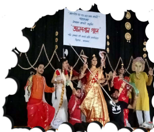
A glimpse of cultural programme