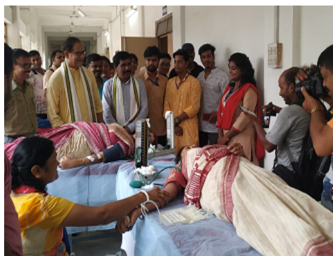
Blood donation camp in College

8) All admission will be provisional subject to the fulfilment of conditions and rules of the College and University.