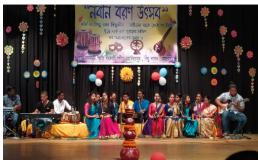
A glimpse of Freshers' welcome programme