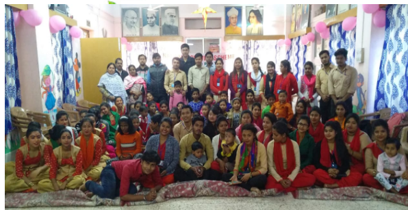
A glimpse of out reach programme at Orphanage

Faculty members of this institution render their help to different segments of the society. Being a socially sensitive citizen, our faculty members are involved in teaching Music, Dance, Paper craft to the weaker section of the society viz. children of Tea Garden workers, children of Brick Kiln workers, Orphanage, Old age homes etc. Faculty members also called on by Department of Social Welfare, Government of Tripura to impart training on music and dance for different target groups of the society.