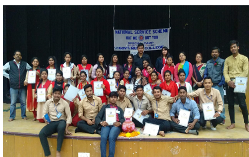
Certificate receiving ceremony after NSS Special Capm