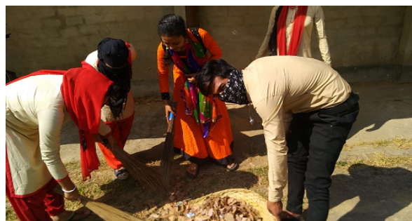
Cleanliness drive by students

In addition to routine curricular activities and teaching-learning process, the college always gives emphasis on community development works. In order to achieve this along with inculcation of human values and social commitment among the students, the college encourages the students to take part in various programmes like Environment Awareness, Health Awareness, Legal Awareness, Blood donation camp, AIDS Control Programme, Disaster Management Programme, Women Empowerment Seminar, Literacy programme, Sanitation and cleanliness drive etc. As far as co-curricular extension services are concerned, the college has an NSS Units of 60 (sixty) volunteers which organize and conduct different social and community service activity in and outside the college on different occasion. A good proportion of students are actively inspired to take part in different social extension and community service activities organized by the NSS unit of the college. The aim of the college is not to produce graduates having theoretical knowledge only, but they are inculcated with moral and human values with a commitment in nation building.