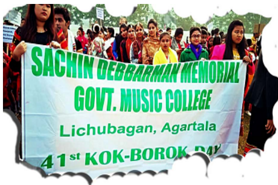
A glimpse of a Rally organized by the Institute

3) Admission to all courses shall be made strictly on the basis of merit of candidates. Practical examination and viva will be conducted to understand technical knowhow of the candidates. The mark of Practical examination will be counted for merit list preparation.